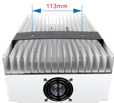
安装孔距— \varnothing 5 Mounting hole Size