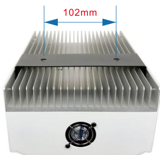
安装孔距— \varnothing 5 Mounting hole Size